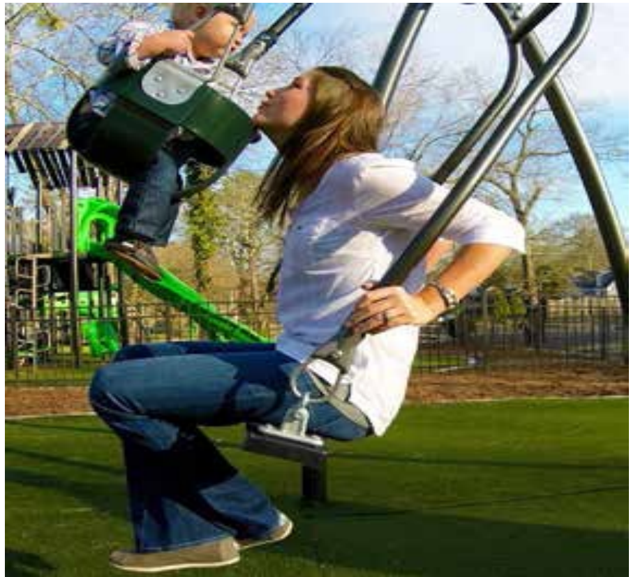
Combo Swing - NRPA August 2015

Allowing for a start to be made on a particular subject under the B- Tech banner and continuing this into a Master qualification.