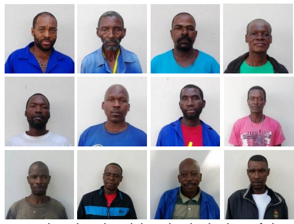
centred project involving the inclusion of the

After numerous clean-ups, Law Enforcement, Metro Police and SAPS patrolling and regular monitoring of the Park, most of the homeless people moved away to other areas, some found jobs and returned home. In the end there were 12 people who refused to move. The Municipality took the opportunity to start an innovative socially-