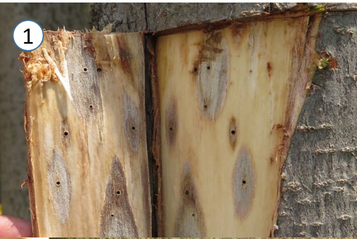
1. Cut & peel pieces of bark around entrance holes of the beetles.