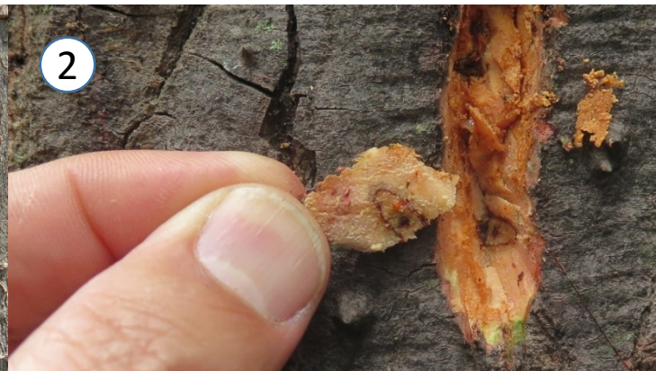
2. Cut or chisel out pieces of stained wood under the bark around tunnels of the beetles.